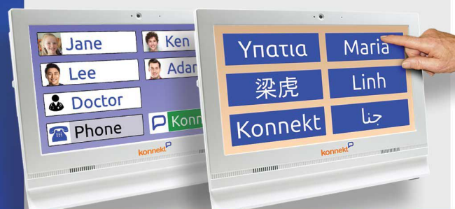
Multi-language support and customisable screen

Try it for 30 days. FULLY PERSONALISED FOR YOU!