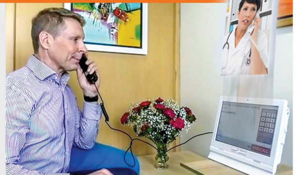
Standard phone calls, with automatic captions